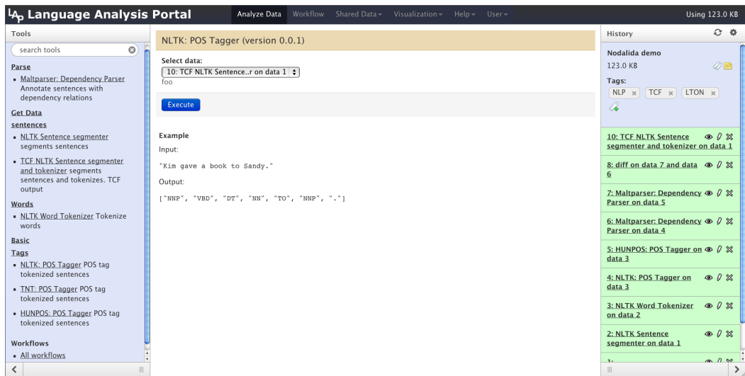
Figure 1: A screenshot of the current implementation of LAP within Galaxy. The left panel displays the installed tools, the center panel shows the currently selected function and the right panel hosts the file history.

have exponential worst-case complexity. At the same time, typical language analysis tasks can be trivially parallelized, as processing separate documents (and for many tasks also individual sentences) constitute independent units of computation. The fact that the portal will submit the sub-tasks of a workflow to an underlying HPC cluster—without the need for user knowledge about job scheduling etc.—means that the user will be able to perform analyses that might otherwise not be possible (and faster and on larger data sets).